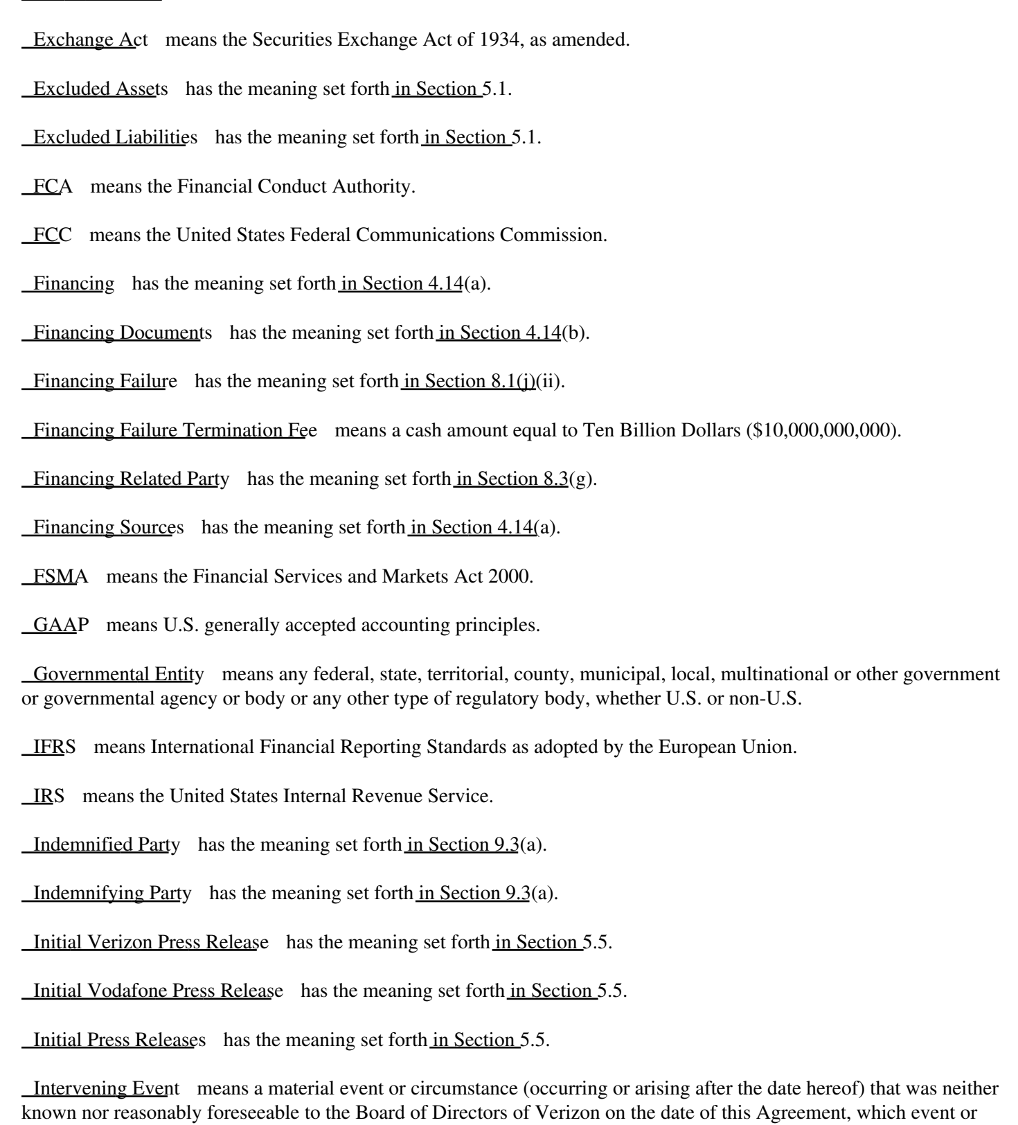
Table of Contents 198

circumstance becomes known to the Board of Directors of Verizon prior to the time at which Verizon receives the Verizon Requisite Vote, other than (i) general events or changes in the industries in which any of Verizon and its Subsidiaries operate; (ii) changes in the market price or trading volume of the Verizon Common Stock; provided, that