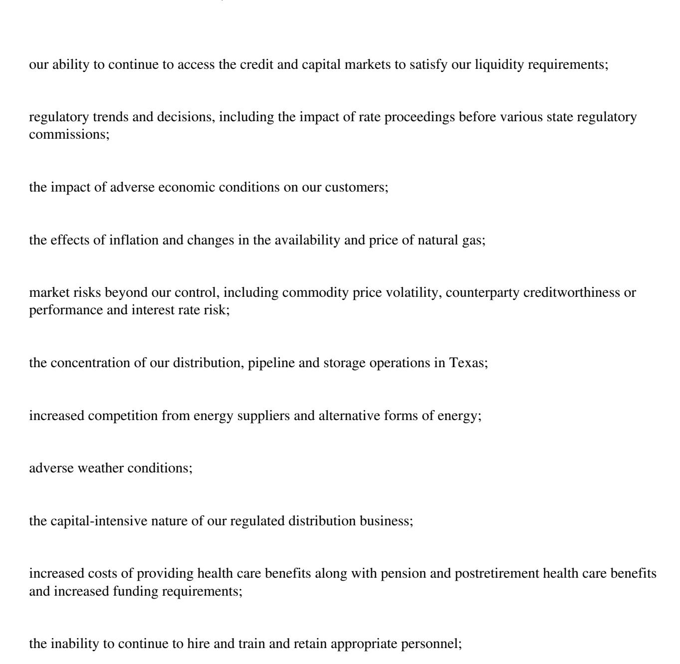
Table of Contents 53

Statements contained or incorporated by reference in this prospectus that are not statements of historical fact are forward-looking statements—within the meaning of Section 27A of the Securities Act of 1933, as amended (the Securities Act ). Forward-looking statements are based on management—s beliefs as well as assumptions made by, and information currently available to, management. Because such statements are based on expectations as to future results and are not statements of fact, actual results may differ materially from those stated. Important factors that could cause future results to differ include, but are not limited to: